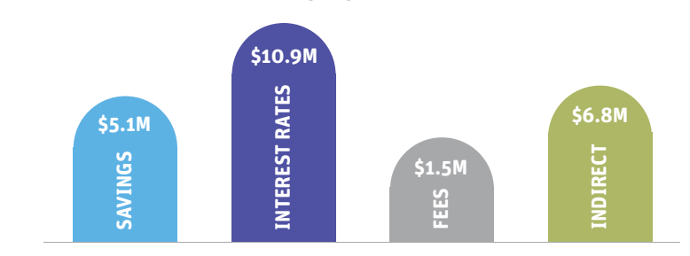
$342 in Financial Benefits per household

Abound is a great place for savers and borrowers alike, with our 14-month certificate rate currently paying one of the best rates in the U.S. When you factor in the indirect benefits, like the Financial Education programs we offer the community, our Credit Union delivered over $30 million in overall value to Kentuckians. Our cooperative is making a difference in dollars saved and we're changing lives.